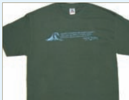
ORGANIC CREDO shortsleeve t-shirt (men's only) M-L-XL-XXL $19